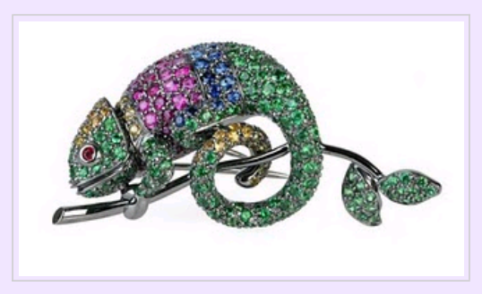
Boucheron Cameleon-on-a-Branch Brooch. Oh how fun and funny! Haute couture jewels can also have a funny bone. We found it in this adorable fellow. Makes me stare, waiting for his tongue (would it be ruby?) to stick out.

You know how we love pearls for girls. Nab this strand and turn the page on collecting more pearls. This is it. Sumptuous Australian strand of 35 white pearls measure 10.8mm to 13mm, with platinum and invisibly set interchangeable sapphire clasp. $26,890