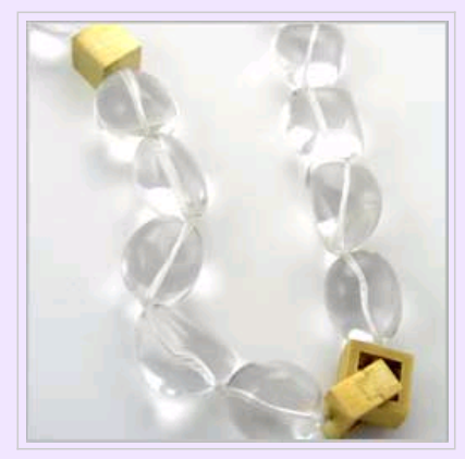
Claudia Endler adorns fortunate jewelry lovers in unexpected but clearly desirable jewels like this luscious white quartz necklace with gold accents. Your go-to accessory time and again at an also yummy $750. Hoorah!