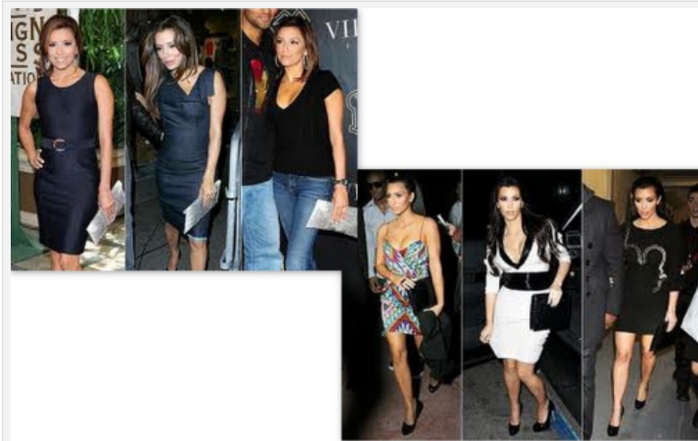
While these lovely ladies have gone through their public splits (both related to texts too...GASP), Kim and Eva seem pretty committed to Adriana Castro

Top the look off with a great clutch, like the gorgeous ones from Adriana Castro, and be prepared to be the envy of your office.