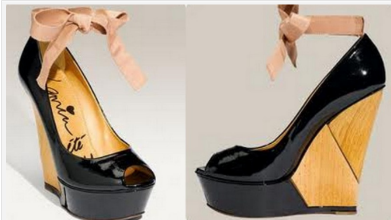
It shouldn't be too hard to figure out that these 'Puzzle' wedges can be the final piece to complete your look

Time to vamp it up! Slip into some funky tights. DKNY has some fun and youthful tights that are sure to bring out your inner Gossip Girl ; while floral tights might be 2009, DKNY is as timeless as they come, in my book. Lace inspired heels (see Dolce & Gabbana's gorgeous satin mary jane ) or a sexy peep to shoe, check out Lanvin's 'Puzzle' wedge for instance and you are on your way to a sexy holiday season.