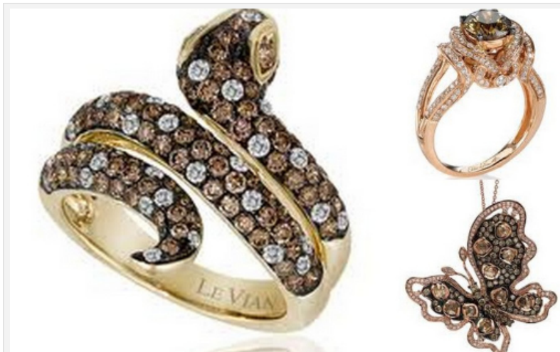
I can't say I'd mind being covered in these chocolate diamonds...YUM

Take some risks and drop the cover-ups. You must be sick of me saying this but you just can't go wrong with the perfect little black dress – add a pair of snazzy heels or booties and you are one chic professionalista. If you have bling, time to show it off. While I am not the biggest chocolate fan, I'd make an exception for Le Vian's chocolate diamonds.