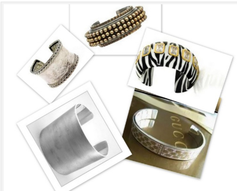
From Cartier to Claudia Endler...I love layering thick and chunky, chunky cuffs and bracelets

Add some sex appeal with black leather, elbow-length Ports 1961 or red Givenchy gloves. If gloves are too dramatic for your taste, consider layering chunky bracelets and/or cuffs.