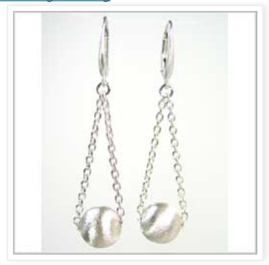
Simply gorgeous and versatile enough to be worn day or night.