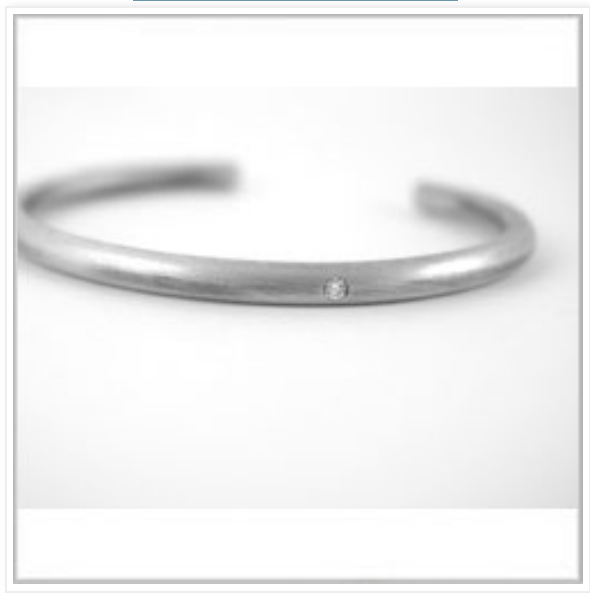
Brushed Silver Armband with Diamond

Alone or stacked, this bracelet makes a subtle statement.