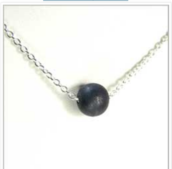
I just cannot get enough of this one!