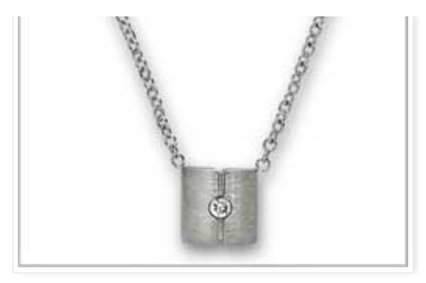
An 18k white gold beauty which speaks for itself.