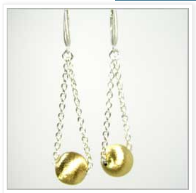
The Silver & Gold Bead Triangle Earring