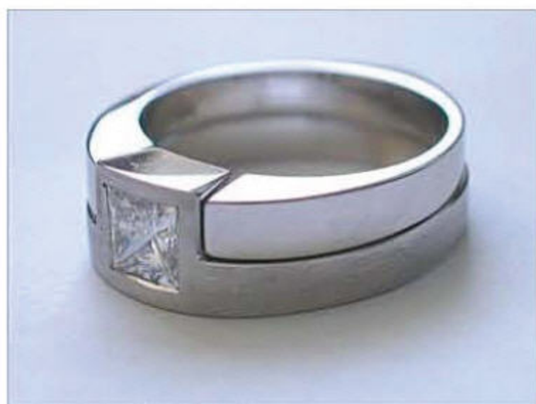
Custom designed wedding set